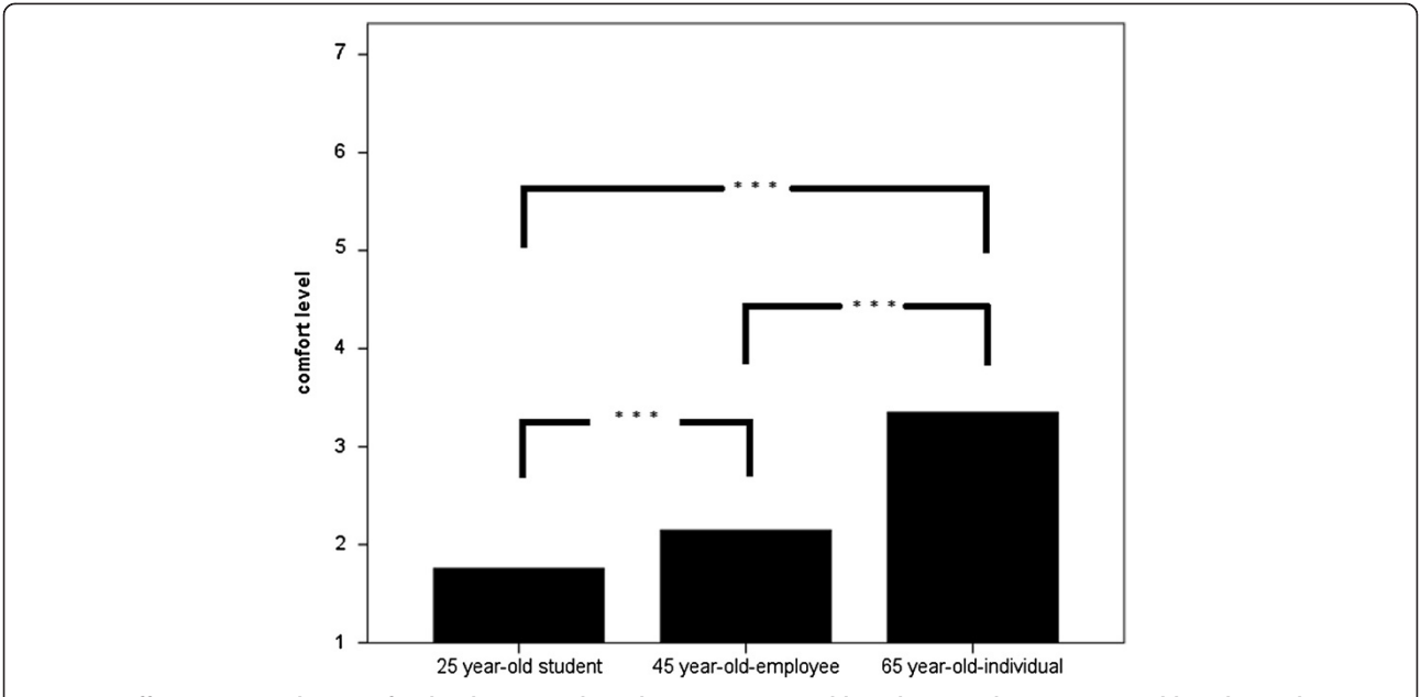
Figure 1 Differences regarding comfort level to prescribe a drug to a 25-year-old graduate student, a 45-year-old-worker and a 65-year-old individual. Means of the comfort levels were calculated using Likert scales.

2.0 regarding the 65-year-old individual. Comfort levels to prescribe were significantly higher regarding the 65-year-old-individual compared to the 25-year-old graduate student and to the 45-year-old-employee. Logistic regression analysis revealed no significant influence regarding the tested dependent variables (age, hours of work per week, etc.) for all three scenarios.